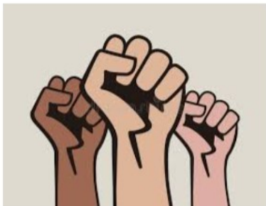
HOLDING ON TO OLD IDEAS