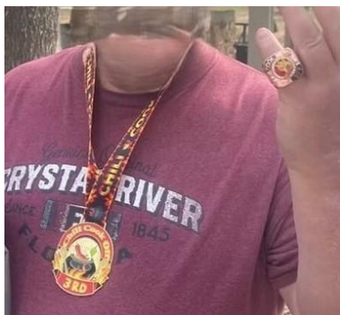
The third-place winner takes pride in displaying hardware.

The Chili-Off was held on Saturday, March 1, at Fort Cooper State Park and was attended by about 100 AA